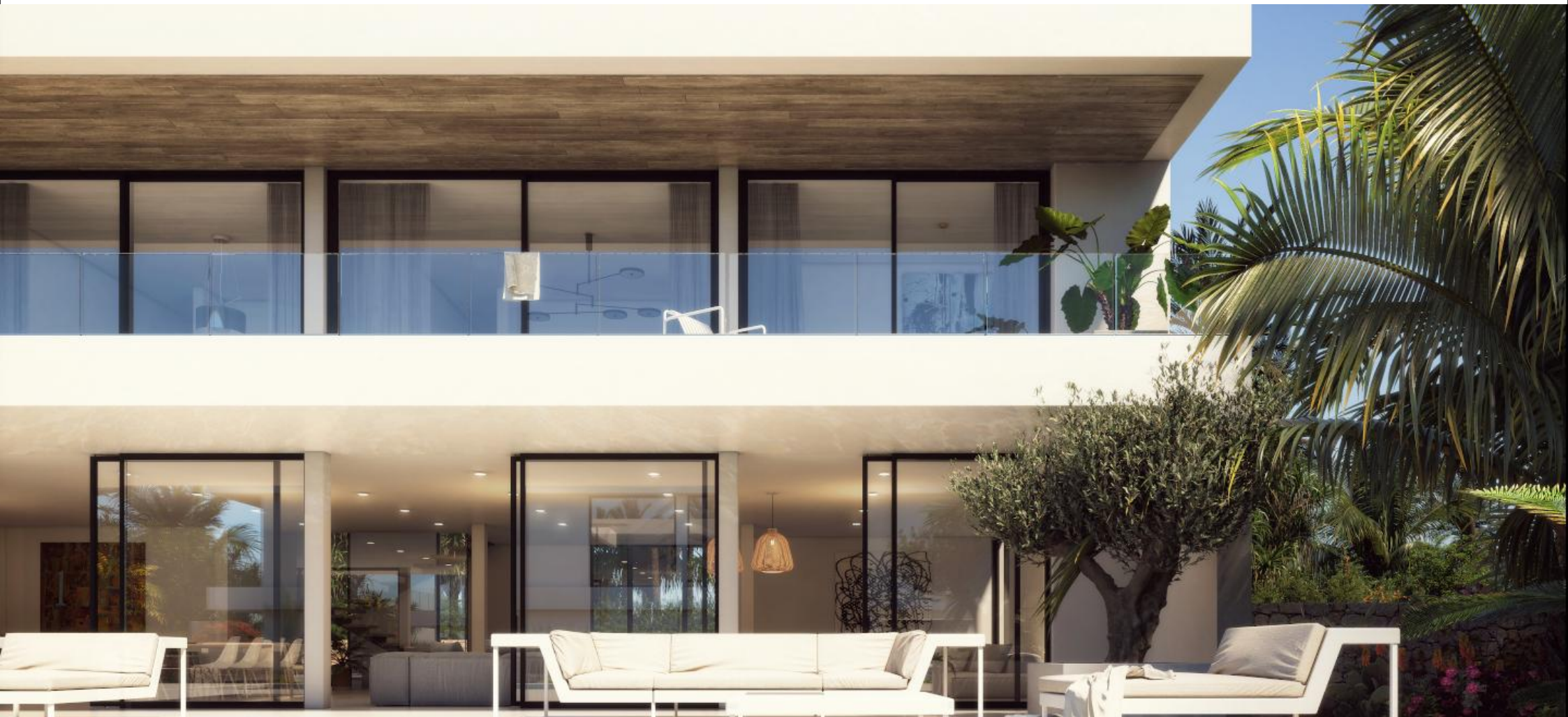
Luxury brand new villa in Talamanca - Ibiza