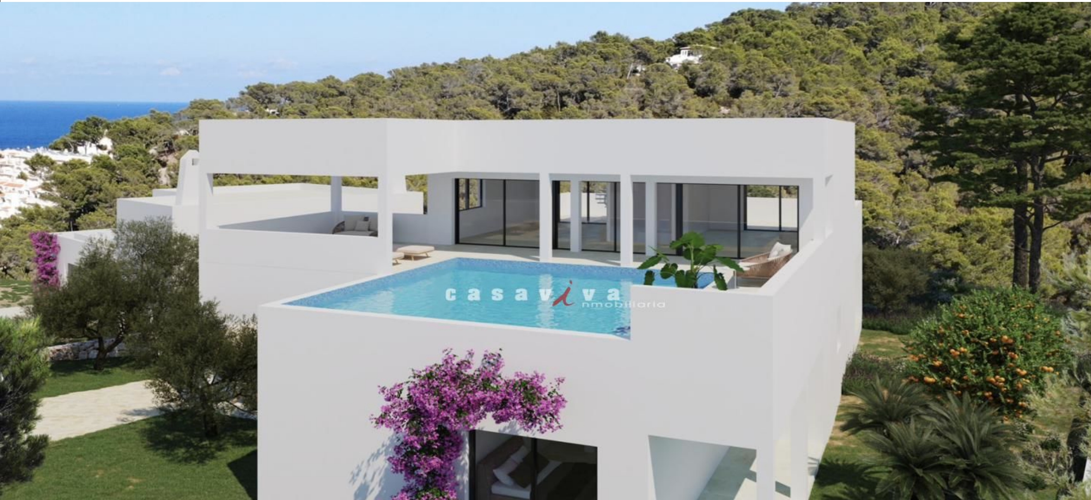
Villa with amazing views in Santa Eulalia - Ibiza