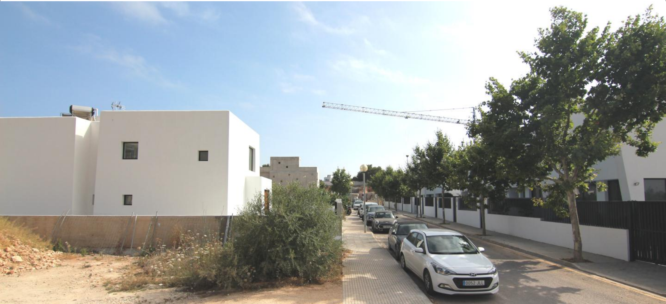
Urban plot of land with project for a house in Jesús - Ibiza