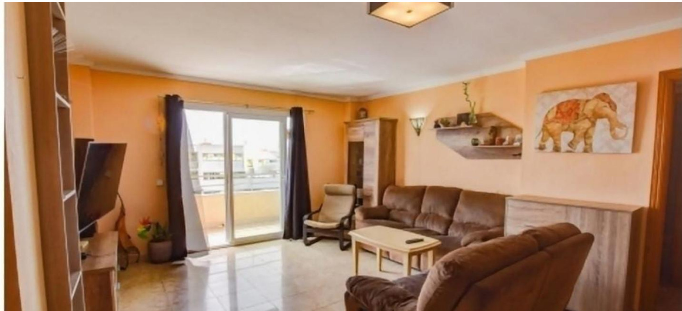
Spacious Flat in Santa Eulària: Terrace and Excellent Location